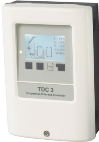
ITEM # 10300