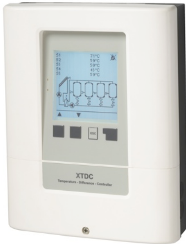
ITEM # 10X00